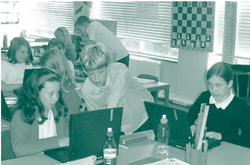
Laptops can bring more flexible patterns of use