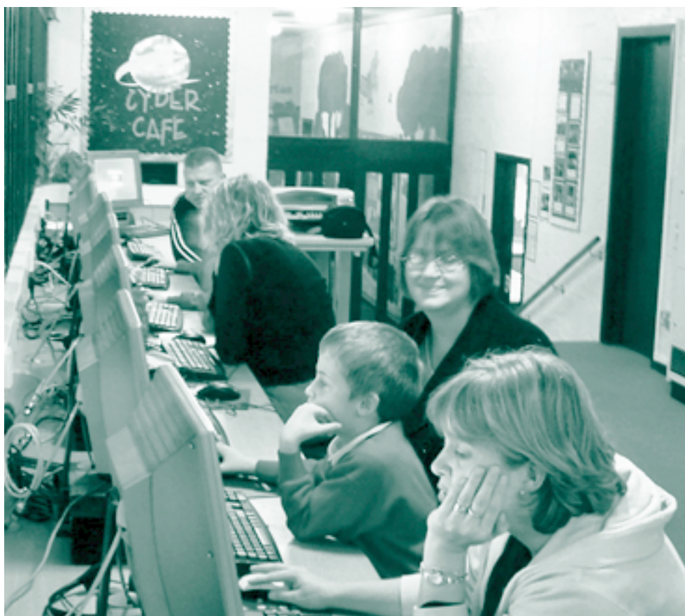
Parents and pupils learn together in the cyber café