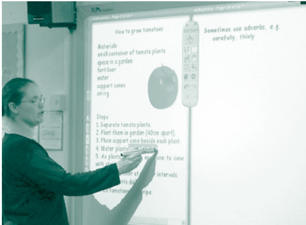
Teacher using interactive whiteboard in a Year 5 literacy lesson