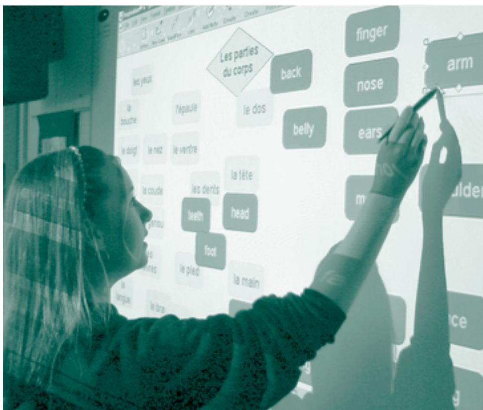
Using the interactive whiteboard in French

The lesson began with a revision of pupils' oral knowledge of hobbies (for example, je regarde/je joue au/je fais du) using projected images and symbols as cues. Pupils responded eagerly to each new picture. When they had responded, the teacher dropped in the text which they read aloud in chorus, and individually. The teacher paid very good attention to accents and pronunciation, which accounted for these pupils' unusually good pronunciation at such an early stage. The electronic presentation enabled the teacher to move swiftly and smoothly from image to image, back and forth as needed, moving the lesson on at a good pace. The pupils concentrated intently and were clearly motivated by the professional and colourful images and text.