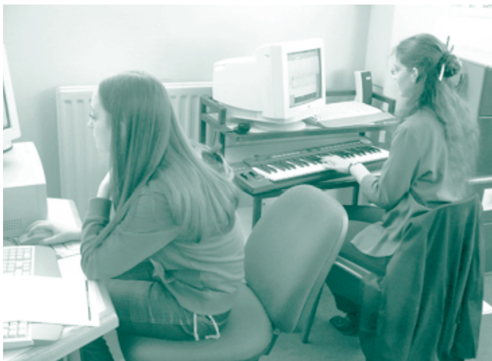
Students using music composition software for AS Level coursework

An art teacher followed an LEA course for one night a week over a term. This resulted in an exhibition and an impressive portfolio of evidence, indicating that she had explored a wide range of applications. She stressed the value of working with other art specialists since she was the only art teacher in the school.