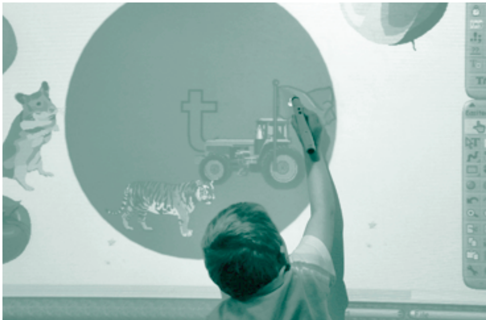
A reception pupil uses an interactive whiteboard in a literacy lesson