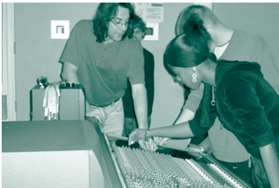
Year 12 music technology students in a recording studio

The template showed a clear structure, with the introduction and subsequent sections being labelled in different colours. Pupils composed within the given structure, but were encouraged to focus on timbre – experimenting with a great variety of tone colours and blends. They made improvements to their work throughout the lesson, and were very confident in their use of the software. Most of the pupils' work was of a good standard, with some very good examples. The emphasis on structure, organisation and continuous revisiting and improvement has also had a positive impact on the pupils' composition work using acoustic instruments.