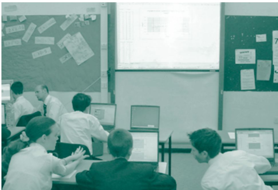
A laptop group comes to terms with correlation in Year 9 mathematics