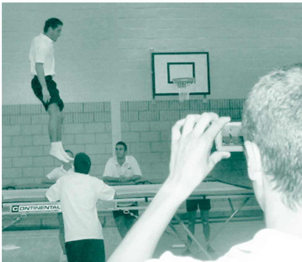
Year 12 PE students capture trampoline work on digital video